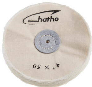
4" X 50 H

3rd Step: High-shine polishing of thermoplastic dentures with HATHO Mira buff and HATHO Polistar Pro Pink