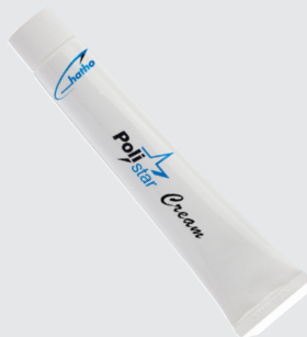
POLISTAR CREAM 75G