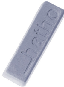
POLISTAR LINTYGREY 90G