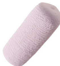
POLISTAR PRO PINK 150G